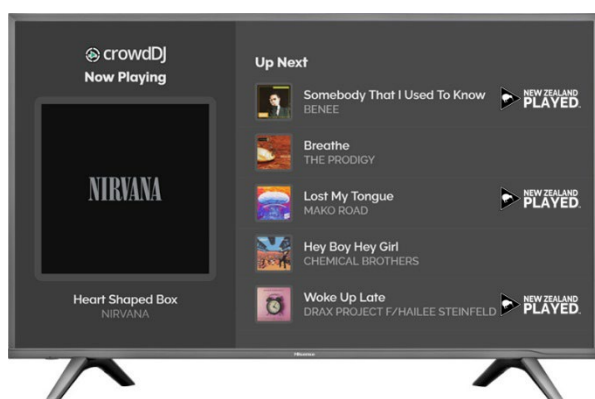
Kiwi Artists are highlighted on-screen